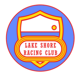
Lake Shore Racing Club