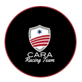
CARA Racing Team